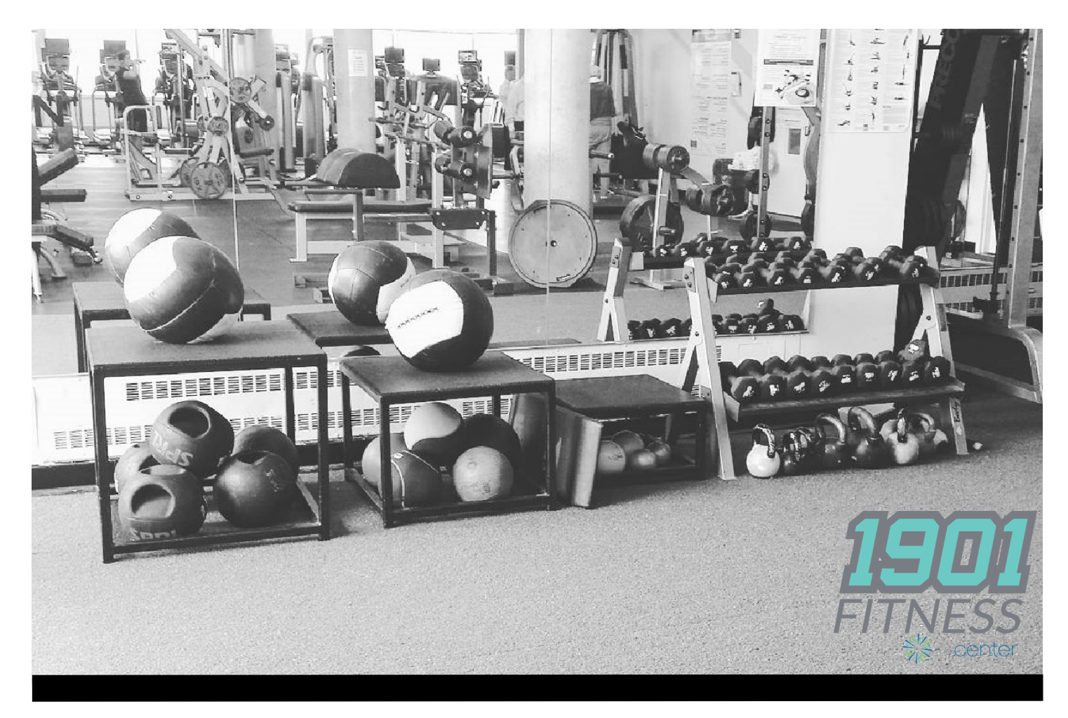
The Scoop The Center's Fitness Newsletter