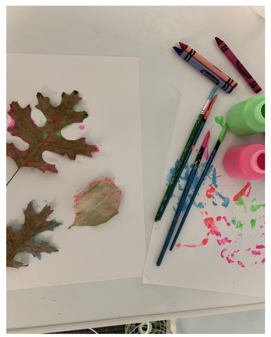
Figure out if you want one leaf or 3 leaves or all of your leaves on the same paper, or on different papers. It's all up to you!

Pour different color paints into small bowls and give each color a different paintbrush. Make sure to wear a smock!